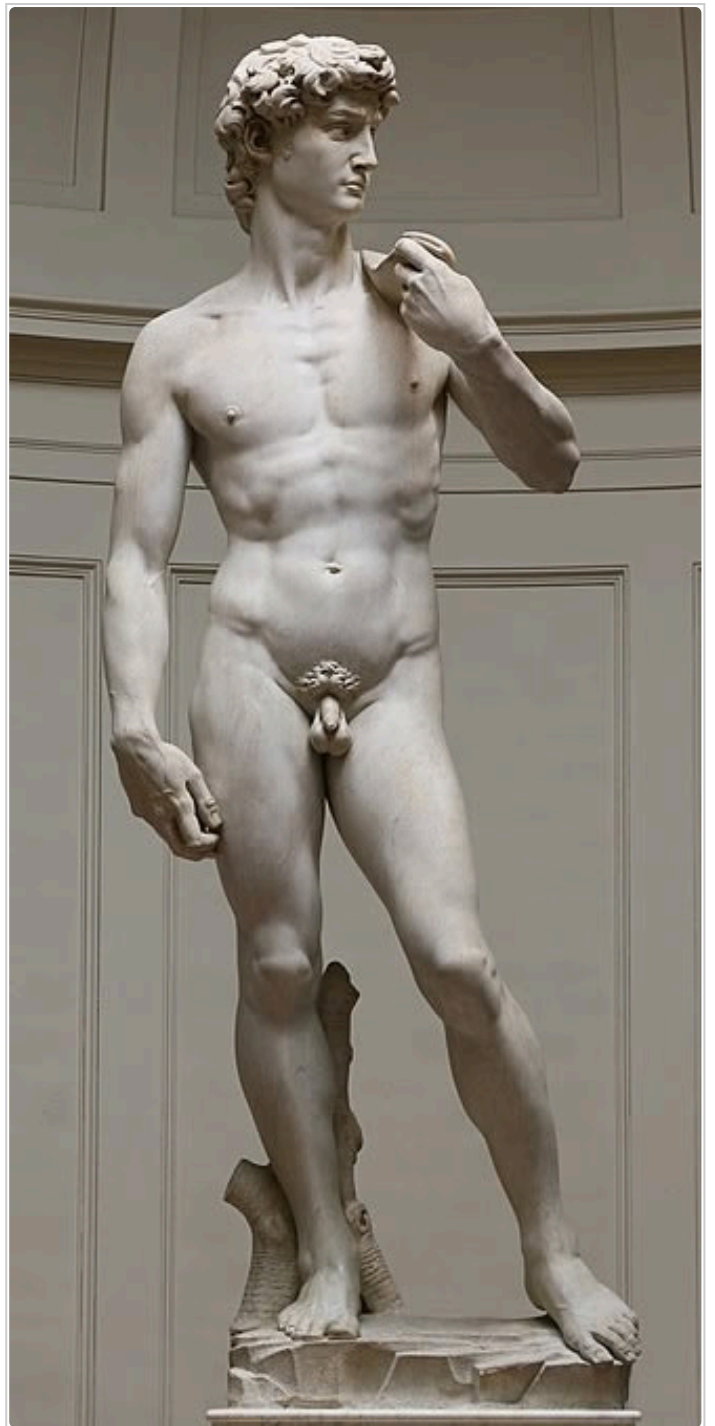
"David" by Michelangelo

Source: Michelangelo, CC BY-SA 3.0 , via Wikimedia Commons