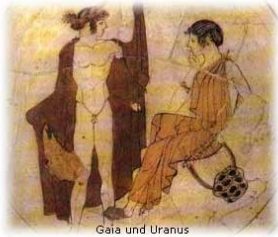
Gaia und Uranus

She presented Kronos with a scythe, made of adamant - obsidian - a clear, hard crystalline sickle and told him to reach up, “as Ouranos lay round Gaia, longing for love ”, and castrate him. Which he did. [2] Thus, forever separating the archetypal parents, as well as launching a new mythology.