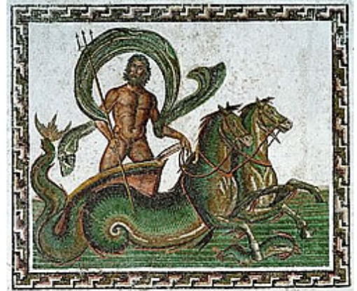
Poséidon/Neptune, hippocamps Musée archéologique de Sousse