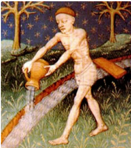
Aquarius

Aquarius' genius for radical invention is being galvanized. Linked to the 11th house, Aquarius represents the sign of hopes, dreams, and wishes. It's also the place on the cosmic dial where synergy happens. And by that I mean – as related through Scripture: “That whenever two or more are gathered in the name of the most Holy, and ask in that name, assistance will be granted.” In fact, miracles have been known to happen. A shift in the cosmic calculus is decidedly underway. It may seem like a long time before Pluto and Neptune change signs in 2024-2025. However, once the Zodiac's chief transformer (Pluto) enters Aquarius, with support from Neptune charting “the way of the pioneer” from Aries, inordinately novel potentials will open for mankind. I happen to think that the next Great Conjunction (that once every 20-year alliance between Jupiter and Saturn) will set the stage. Scheduled for winter Solstice, 2020, the Zodiac's Law and Order duo will merge in early degrees of Aquarius; and it's a fair bet that mundane law will then come to more truly reflect Universal Law!