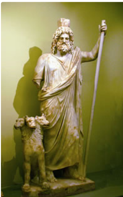
Hades with Cerberus

Due to the lack of moral vision stemming from high places, the collective must quickly come to realize that other stories about who we are, as a humanity, are not only possible... they represent our best chance at collective transformation. Indeed, the time has come for a chapter change in the book of human life and it's entitled: Aquarian Age values and precepts. Just as the human infant labors to be born, this next Age Phase transition is not without its labors! What's fascinating is that Pluto's current transit of Capricorn (which lasts until 2024) runs in synch with Neptune's transit of its own kingdom Pisces (which also lasts until 2024). These two positions place Aquarius into "the squeeze," and that puts truth and human liberty at a massive disadvantage. On one side of this "sandwich," Pluto evokes patriarchal power and state controls (from Capricorn), while Neptune supplies endless streams of deception direct from Pisces, which sits on the other side of the "cosmic sandwich."