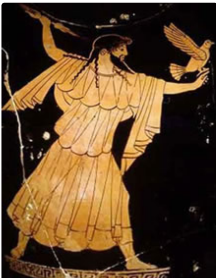
Zeus with eagle and lightning. Athenian red-figure amphora 5th Century B.C., Louvre, Paris

The Creation Story bequeathed to us by the Ancient Greeks and Romans centers on three realms that jointly govern earth, the manifest realm. These three spheres were divided among three brothers. Jupiter-Zeus inherited rule of the surface world; Neptune-Poseidon was granted rule of the oceans; and Pluto-Hades was assigned dominion over the subterranean underworld. Interesting parallels exist between this tri-fold division and modern psychology’s view of the human mind, not to mention consciousness, itself. Freud’s widely accepted theory explained that human beings rely on the function of their conscious mind (Jupiter/surface world). However, he further explained that behavior is deeply shaped by the unconscious mind (Neptune’s uncharted sea domain), as well as the subconscious mind (Pluto’s burial ground full of old ghosts). This tri-fold division also resonates with the idea that human action and motivation emerge from interplay between the ego, super-ego, and the id.