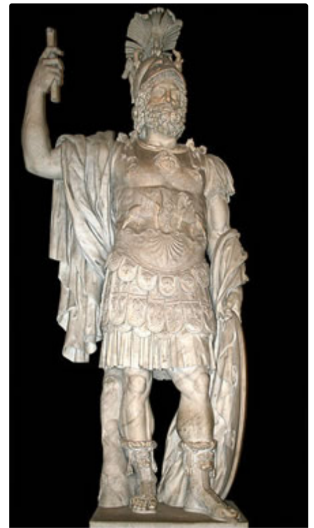
Colossal statue of Mars. Roman artwork.

Before Edison could prove that an invisible energy source existed, most people went to bed at sundown and lived by the rhythms of night and day. Electricity, once implemented, radically altered the paradigm. Although we can't yet see what the next set of paradigm changing inventions will look like, that doesn't mean they're not already in the works! During ordinary times, invention happens. Imagine how strong the current of innovation will run once the Aquarian Age gets fully underway? There's no telling what's ahead. When the will was in place, as was true during The Manhattan Project, many of the world's most advanced minds joined forces. Although their efforts were directed at building the weapon to end all other weapon systems (an outgrowth of the still sustained dominant archetype of