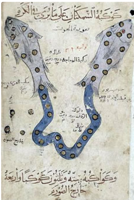
Pisces, Kitab al-Bulhan Oxford Digital Library

The emphasis on polarity that defines the nation's political sphere is also present at all major sporting events. Inside these impassioned venues, countless fans root for one team as it relentlessly fights the other for The Title. The idea that ends up subliminally planted is that there are only two possible choices, a winner and a loser. Furthermore, the message is projected that life is primarily based on the interplay between two antithetical forces. This becomes a core, largely unquestioned belief. And from a social conditioning perspective, it extends to citizens the idea that other nations function either as our friends or our enemies. The stance of "with us or against us" projects polarity writ large. And we find the roots to this notion of absolute dualism in the Bible with its strong emphasis on good and evil.