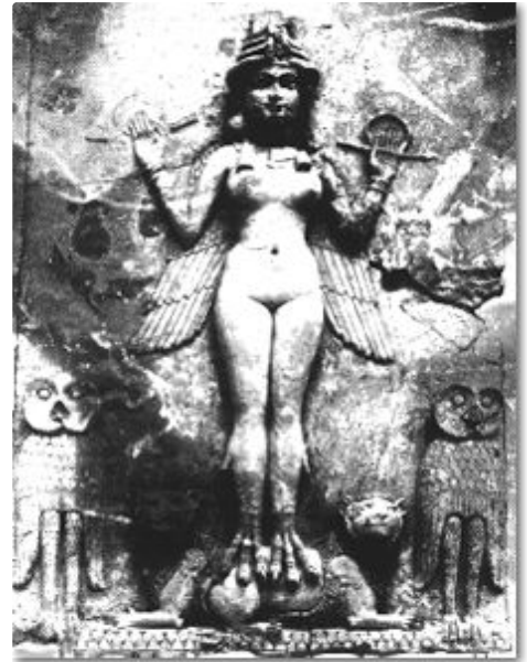
Earliest known representation of Lilith: Terracotta - Sumerian Relief, 1950 B.C.

The Moon travels along an elliptical path around the Earth. An ellipse has two focal points, and the other focal point, not occupied by the Earth has been called the Dark Moon, the Black Moon or Lilith. This is a slightly simplified definition, since, actually, the Moon and the Earth both move around their common centre of gravity, and the path of the Moon is not a neat ellipse, but a rather wobbly affair. One must distinguish between the mean orbit of the Moon, which is a slowly elongating ellipse, and the actual orbit, which vacillates around the mean path, due to interference of various kinds. Just as there is a "mean" and a "true" Lunar Node, so there is a "mean" and a "true" ellipse and a "mean" and a "true" Lilith. I write "true" in inverted commas, because the Moon's Node is only "true" about twice per month, when the Moon is actually on it, for the rest of the time, it is as "untrue" as the mean Node. In fact, when working with a point so close to the Earth, one should also take the great parallax into consideration, i.e. consider, from which point on the Earth one is actually looking at a point in the heavens. Astrology observes the planets geocentrically, as if from the Earth's centre, and not topocentrically, from the actual place of the observer.